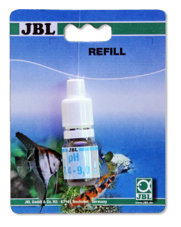
JBL pH Test 7.4-9.0 pH test in aquariums and ponds in the range 7.4-9.0