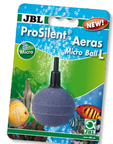
JBL ProSilent Aeras Micro Ball L Air stone for fine air bubbles