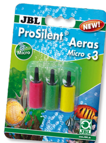
JBL ProSilent Aeras Micro S3 Air stone set for fine air bubbles in aquariums