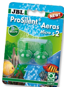
JBL ProSilent Aeras Micro S2 Ball air stones for fine air bubbles in aquariums