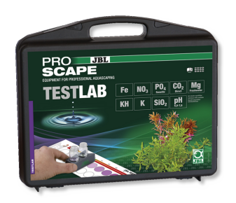
JBL Testlab ProScape Test case for water analysis in plant aquariums