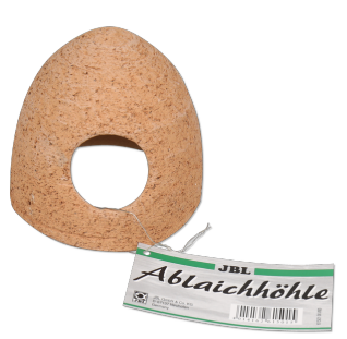
JBL Ceramic spawning cave Ceramic cave for freshwater aquariums