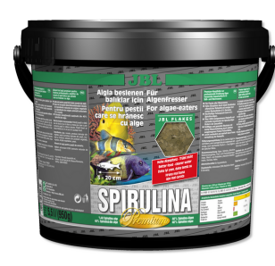
JBL Spirulina Premium main food for algaeeating aquarium fish