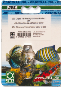
JBL Clips T5/T8 (Metal) Metal holder für fluorescent tubes