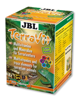
JBL TerraVit Powder Vitamins and trace elements for terrarium animals