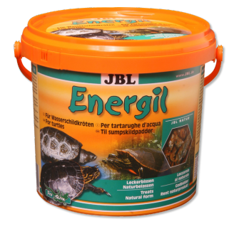
JBL Energil Main food for turtles and pond terrapins