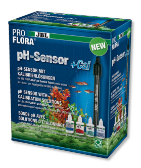
JBL PROFLORA pH-Sensor+Cal