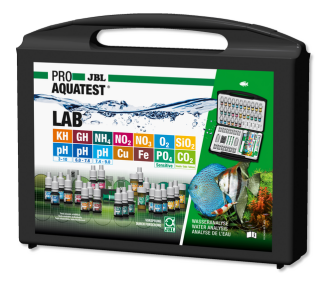
JBL PROAQUATEST LAB Test case with 13 water tests

Test case with most important water tests + iron test