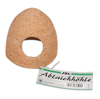
JBL Ceramic spawning cave Ceramic cave for freshwater