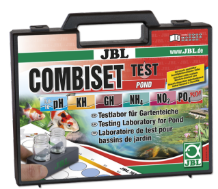
JBL Test Combi Set Pond

Test case with most important water tests + NH4 test