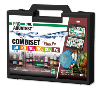
JBL PROAQUATEST COMBISET Plus Fe Test case with most important water tests + iron test