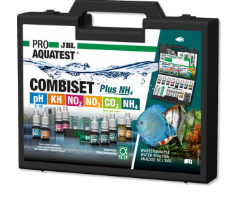
JBL PROAQUATEST COMBISET Plus NH4 Test case with most important water tests + NH4 test