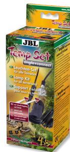
JBL TempSet angle+connect Installation kit for lamps in terrariums