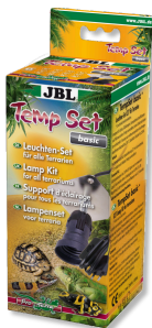
JBL TempSet basic Installation kit for lamps in terrariums