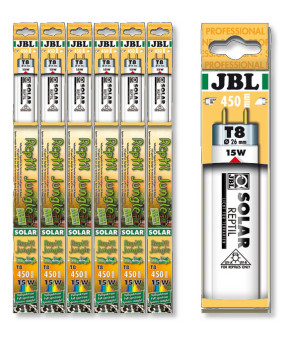
JBL SOLAR REPTIL JUNGLE T8

T8 terrarium fluorescent tube for rainforest animals