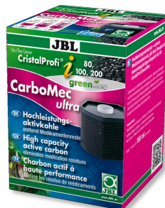
JBL CarboMec ultra Pad CristalProf i60/80/100/200 Filter insert with activated carbon for CP i range