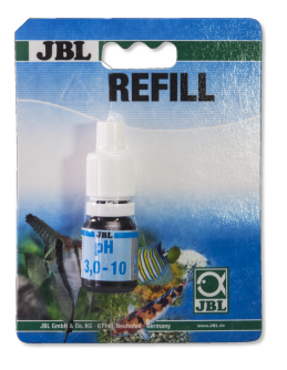
JBL pH Test 3.0-10.0 Quick test to determine the acidity