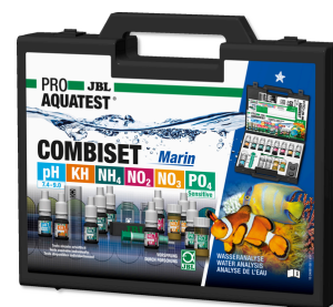
JBL PROAQUATEST COMBISET Marin Test case for water analyses in marine aquariums