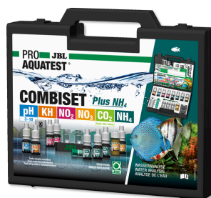
JBL PROAQUATEST COMBISET Plus NH 4 Test case with most important water tests + NH 4 test