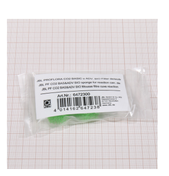
JBL PF CO2 BIO REAKTOR filter