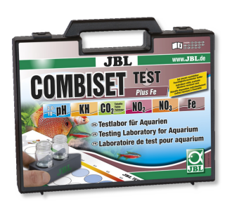
JBL Test Combi Set plus Fe

Test case with most important water tests + iron test