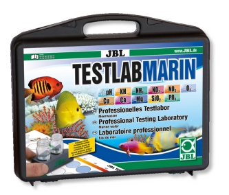
JBL Testlab Marin Professional test case for the analysis of saltwater