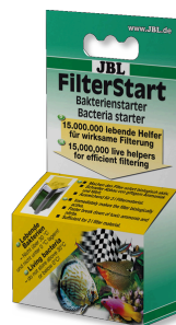
JBL FilterStart Bacteria for the activation of filters