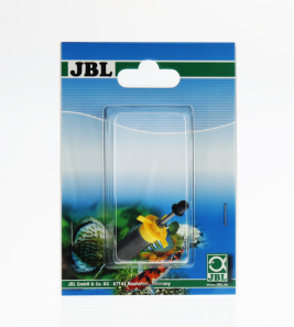
JBL CP i 60/80 greenline impeller