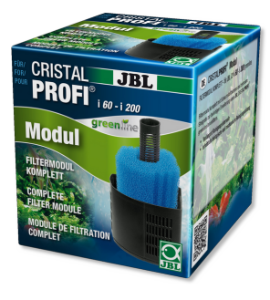
JBL CRISTALPROFI i greenline module Filter module for internal filter series CristalProfi i