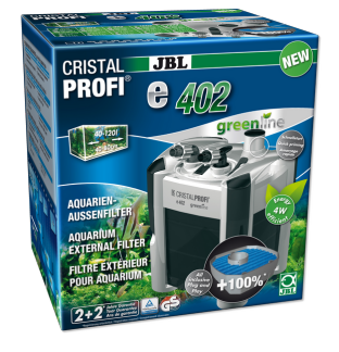
JBL CRISTALPROFI e402 greenline External filter for aquariums from 40-120 litres