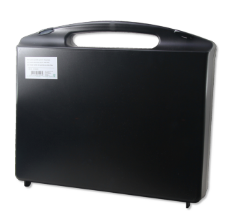
JBL Testlab empty + inserts