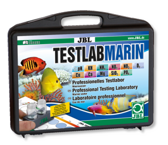
JBL Testlab Marin Professional test case for the analysis of saltwater