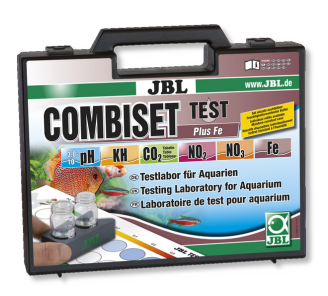
JBL Test Combi Set plus Fe

Test case with most important water tests + iron test