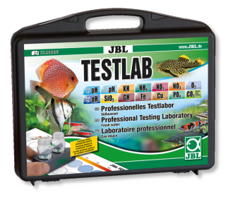
JBL Testlab Test case with 13 tests f. freshwater analysis Testlab

Test case with most important water tests + iron test