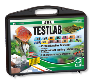
JBL Testlab Test case with 13 tests f. freshwater analysis Testlab

Test case with most important water tests + iron test