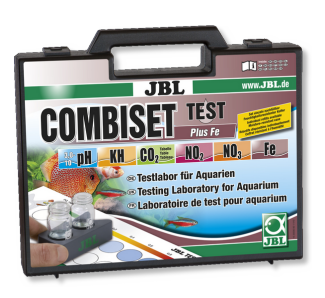
JBL Test Combi Set plus Fe

Test case with most important water tests + iron test