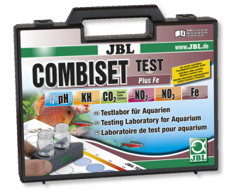
JBL Test Combi Set plus Fe Test case with most important water tests + iron test

You can find a complete overview here: https://www.jbl.de/qr/25375