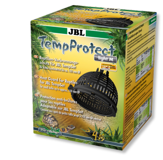
JBL TempProtect light Reptile thermal burn protection for JBL TempSets