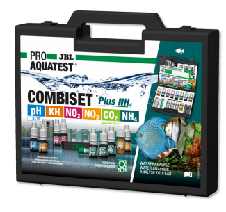
JBL PROAQUATEST COMBISET Plus NH4

Test case with most important water tests + iron test