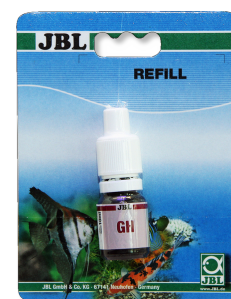
JBL GH Test Quick test to determine the total hardness