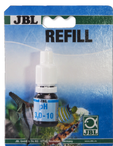
JBL pH Test 3.0-10.0 Quick test to determine the acidity