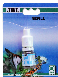
JBL pH Test 7.4-9.0 pH test in aquariums and ponds in the range 7.4-9.0