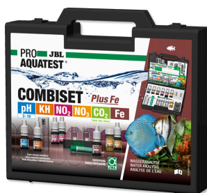
JBL PROAQUATEST COMBISET Plus Fe Test case with most important water tests + iron test