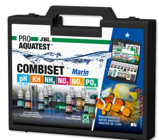
JBL PROAQUATEST COMBISET Marin Test case for water analyses in marine aquariums