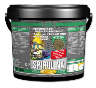
JBL Spirulina Premium main food for algaeeating aquarium fish