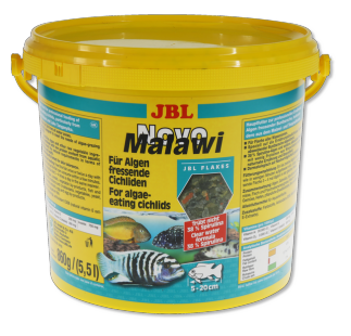
JBL NovoMalawi Main food flakes for algaeeating cichlids