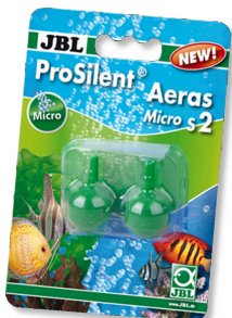
JBL ProSilent Aeras Micro S2 Ball air stones for fine air bubbles in aquariums