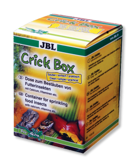
JBL CrickBox Shaker box to sprinkle powder on feeder insects