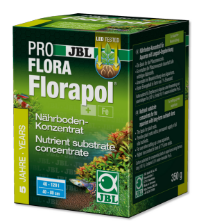
JBL PROFLORA Florapol Long-term nutrient substrate concentrate