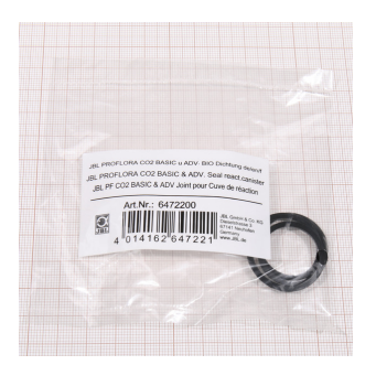
JBL PF CO2 BIO REAKTOR seal