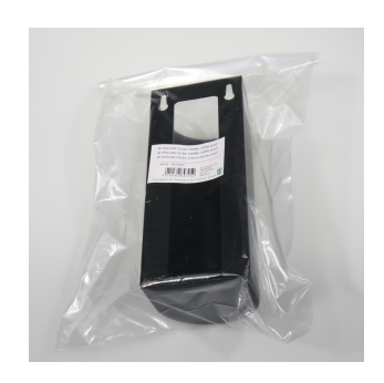
JBL PF CO2 BIO THERMAL CASING