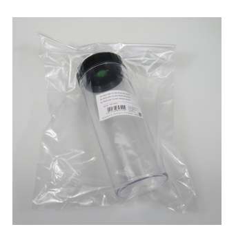
JBL PF CO2 BIO REAKTOR