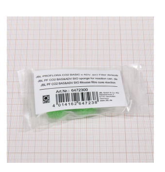
JBL PF CO2 BIO REAKTOR filter