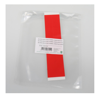
JBL PF CO2 BIO THERMAL CASING adhesive tape

Glass CO2 diffuser for freshwater tanks from 40-300 I