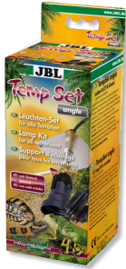
JBL TempSet angle Installation kit for lamps in terrariums