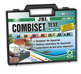
JBL Test Combi Set Plus NH4 Test case with most important water tests + NH4 test