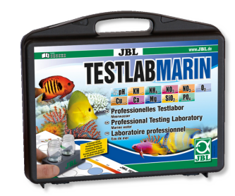
JBL Testlab Marin Professional test case for the analysis of saltwater