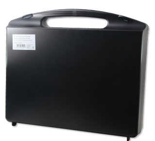
JBL Testlab empty + inserts