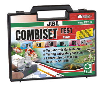
JBL Test Combi Set Pond The most important water tests for garden ponds