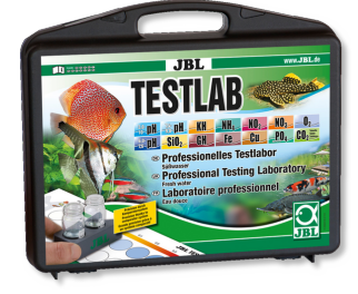
JBL Testlab Test case with 13 tests f. freshwater analysis Testlab