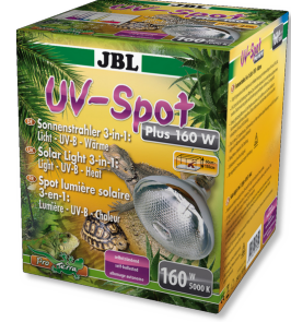
JBL UV-Spot plus UV spotlight with daylight spectrum for terrariums