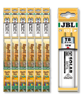
JBL SOLAR REPTIL SUN T8

T8 terrarium fluorescent tube for rainforest animals