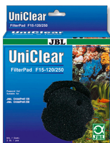
JBL FilterPad F15 Coarse foam pad for aquarium filter CristalProfi