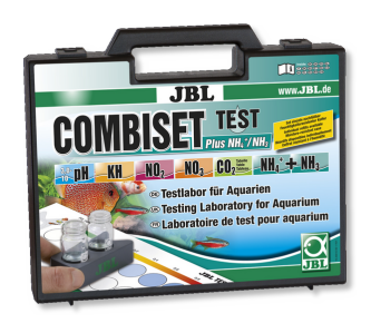
JBL Test Combi Set Plus NH4

Test case with most important water tests + NH4 test