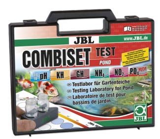
JBL Test Combi Set Pond

Test case with most important water tests + NH4 test