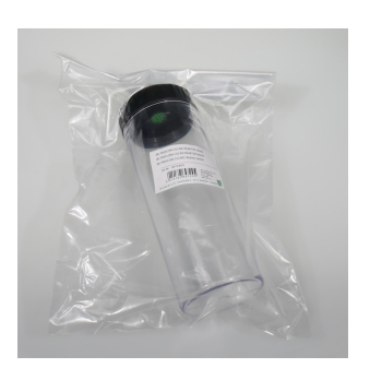
JBL PF CO2 BIO REAKTOR