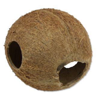
JBL Cocos Cava Coconut cave for aquariums and terrariums