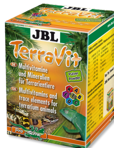
JBL TerraVit Powder Vitamins and trace elements for terrarium animals