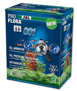
JBL PROFLORA m001 Fitting to reduce pressure