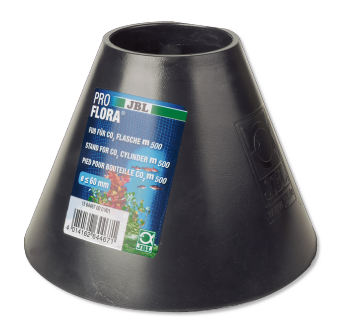
JBL PROFLORA stand CO2 storage cylinder 500 g Stand for cylinders of CO2 fertiliser systems