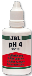
JBL Buffer Solution pH 4.0 Calibration solution with pH 4.0 for pH electrodes