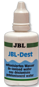
JBL Dest Distilled water to clean pH electrodes