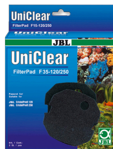
JBL FilterPad F35 Fine foam pad for aquarium filter CristalProfi