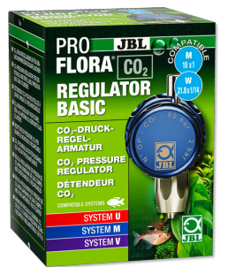
JBL PROFLORA CO2 REGULATOR BASIC Press. regulator for CO2 aquarium plant fertil. system