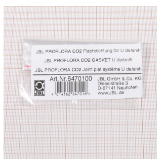
JBL PF CO2 flat gasket for u