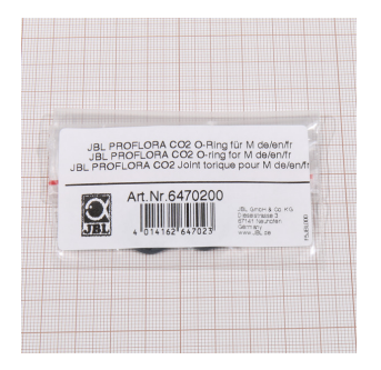
JBL PROFLORA CO2 Oring for m