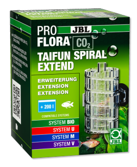
JBL PROFLORA CO2 TAIFUN SPIRAL EXTEND Extension for JBL PROFLORA CO2 TAIFUN SPIRAL 5 / 10