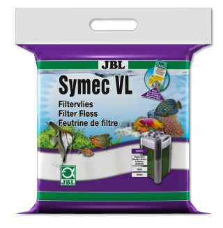
JBL Symec VL Filter wool fleece to remove water cloudiness