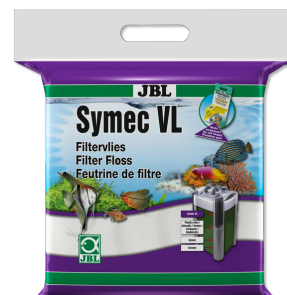
JBL Symec VL Filter wool fleece to remove water cloudiness