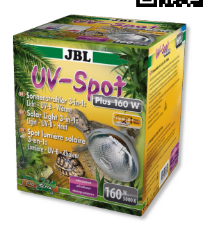
JBL UV-Spot plus UV spotlight with daylight spectrum for terrariums