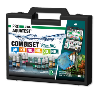
JBL PROAQUATEST COMBISET Plus NH4

Test case with most important water tests + iron test