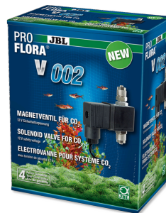
JBL PROFLORA v002 Noiseless solenoid valve