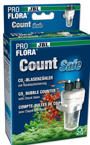
JBL PROFLORA CO2 Count Safe Bubble counter with backflow stop